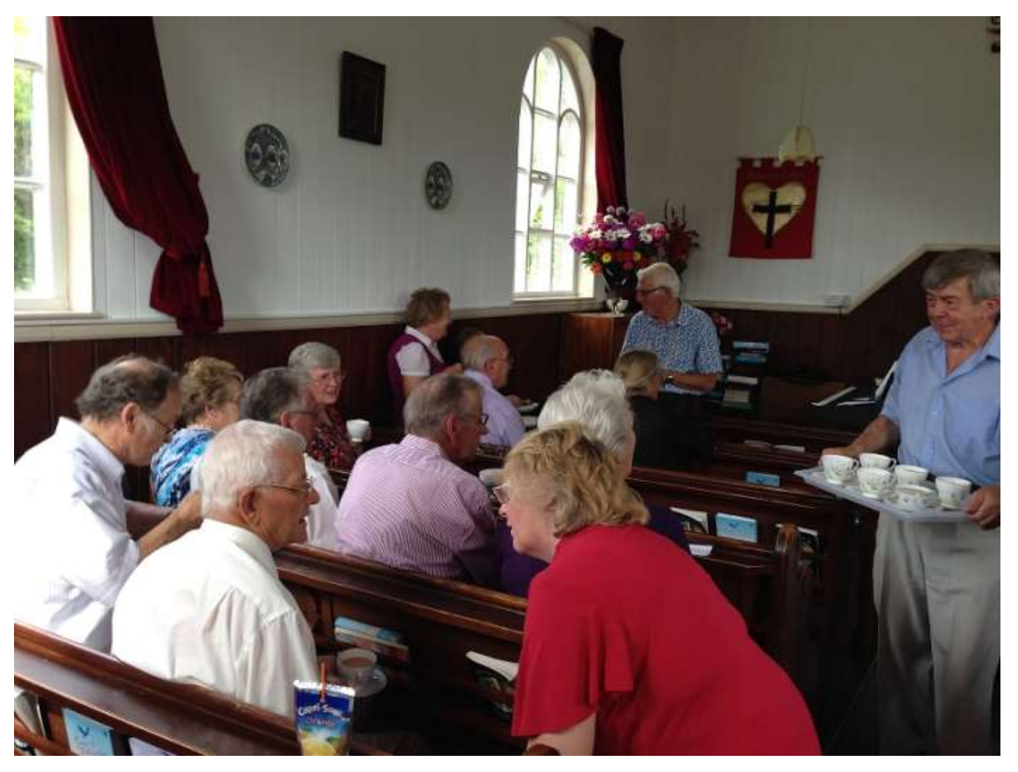
Chapel Dedication article page 4